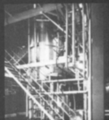
Rosedowns Semi Continuous Deodoriser processing cocoa butter at a rate of 4,000 lbs/hr.

ROSE, DOWNS & THOMPSON LIMITED Cannon Street, Hull, England. Tel.: Hull 29864. Telex.: 52226. Cables.: Rosedowns Hull.